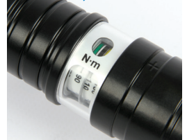
Pull Out Torque Adjustment Bar