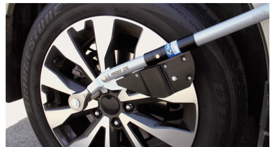
Push-Thru Ratchet Head

For other larger sizes visit sykespickavantexport.co.uk