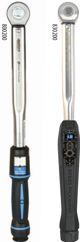
Torque wrenches secured by wire tether