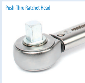
Push-Thru Ratchet Head