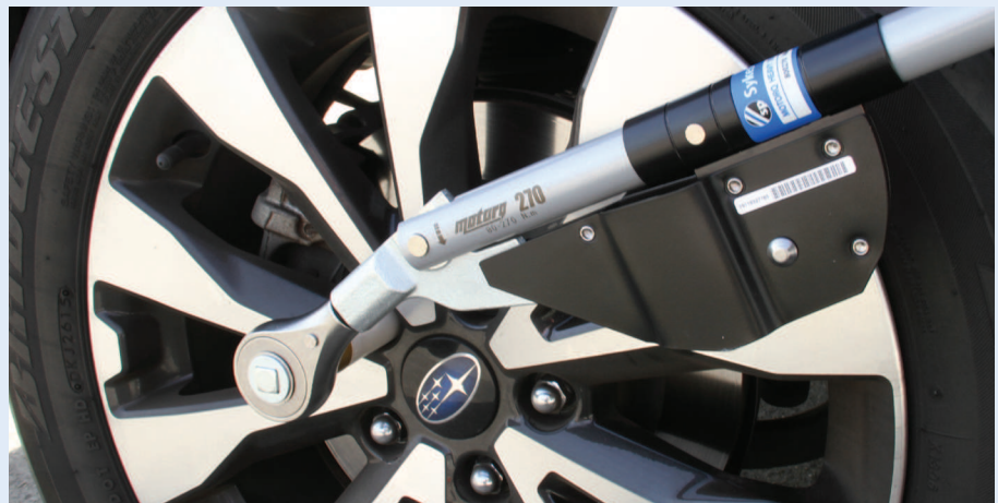
Push-Thru Ratchet Head