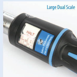
Large Dual Scale